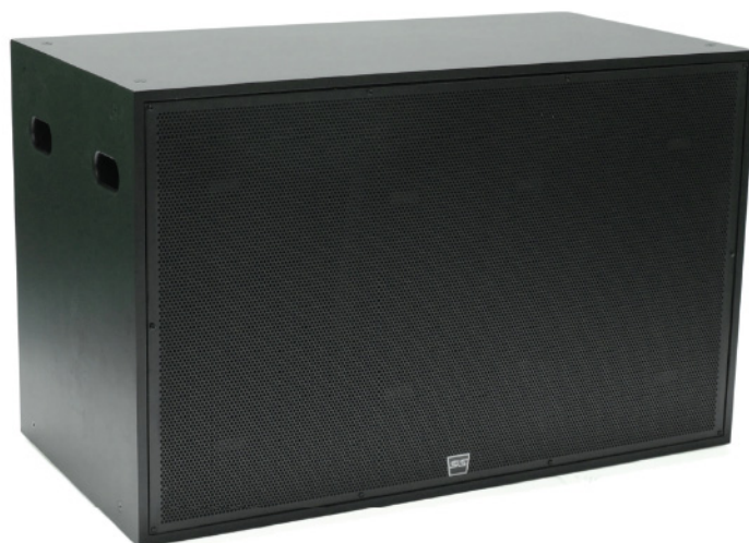
Figure 1-1 CS218I-CM

The SLS™ CS218I-CM is a high-performance flyable subwoofer for use in cinema auditoriums and professional applications. The unit contains 24 M10 rigging points at convenient locations around the loudspeaker. For mounting to the building structure, you can attach rigging hardware, as described in Section 2.1 .