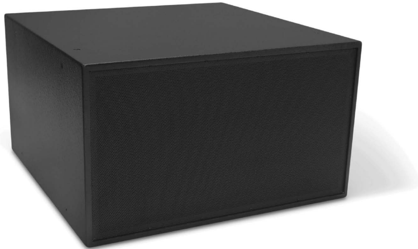
Figure 1-1 Dolby 218-I

The Dolby 218-I is a high performance flyable subwoofer for use in cinema auditoriums and professional applications. The unit contains sixteen M10-1.5 rigging points at convenient locations around the loudspeaker. For mounting to the building structure, you can attach rigging hardware, as described in Section 2.1 .